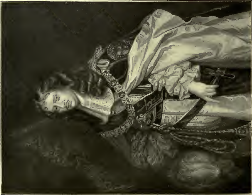
EDWARD, FIRST EARL OF SANDWICH, K.G.

From the engraving by J. Thomson after Lely.