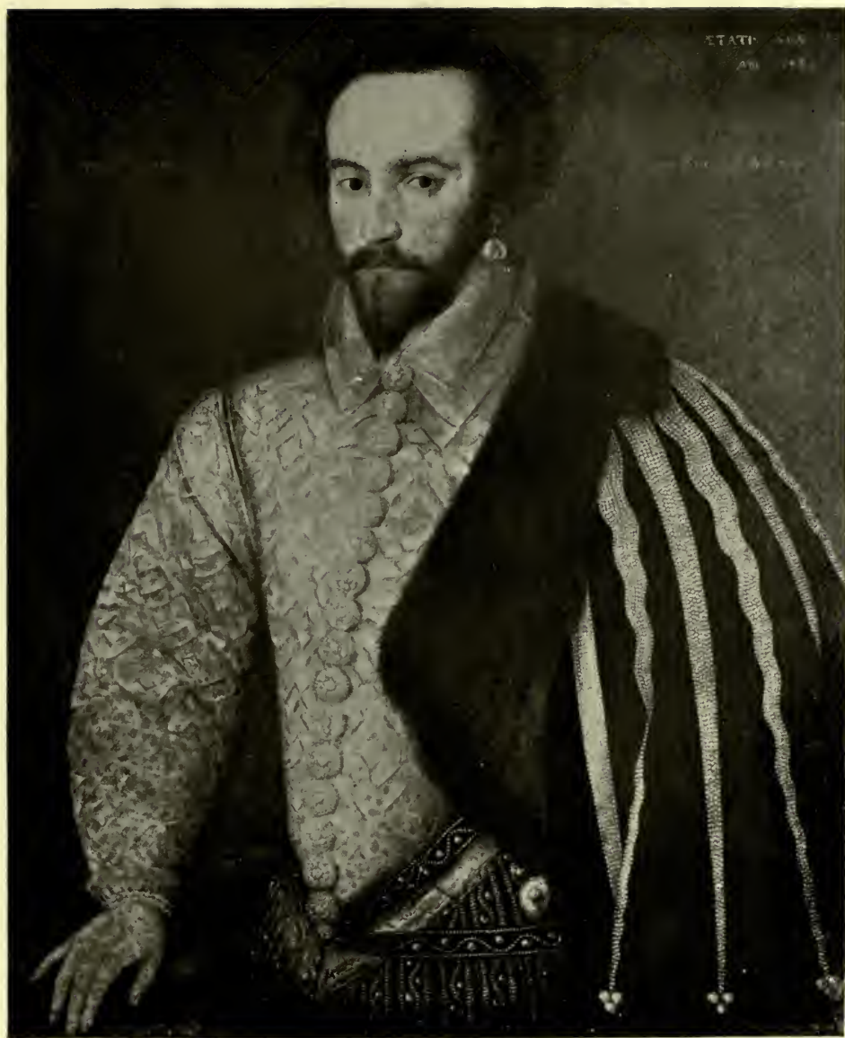
SIR WALTER RALEIGH, KNT.

From the painting in the National Portrait Gallery.