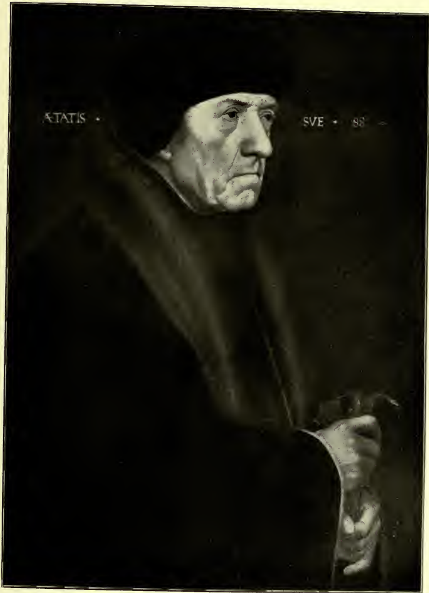
DR. JOHN CHAMBRE.

From the original painting by Holbein in the Imperial Gallery, Vienna.