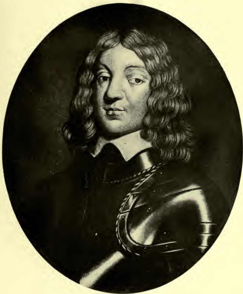
SIR WILLIAM PARSONS, BART.