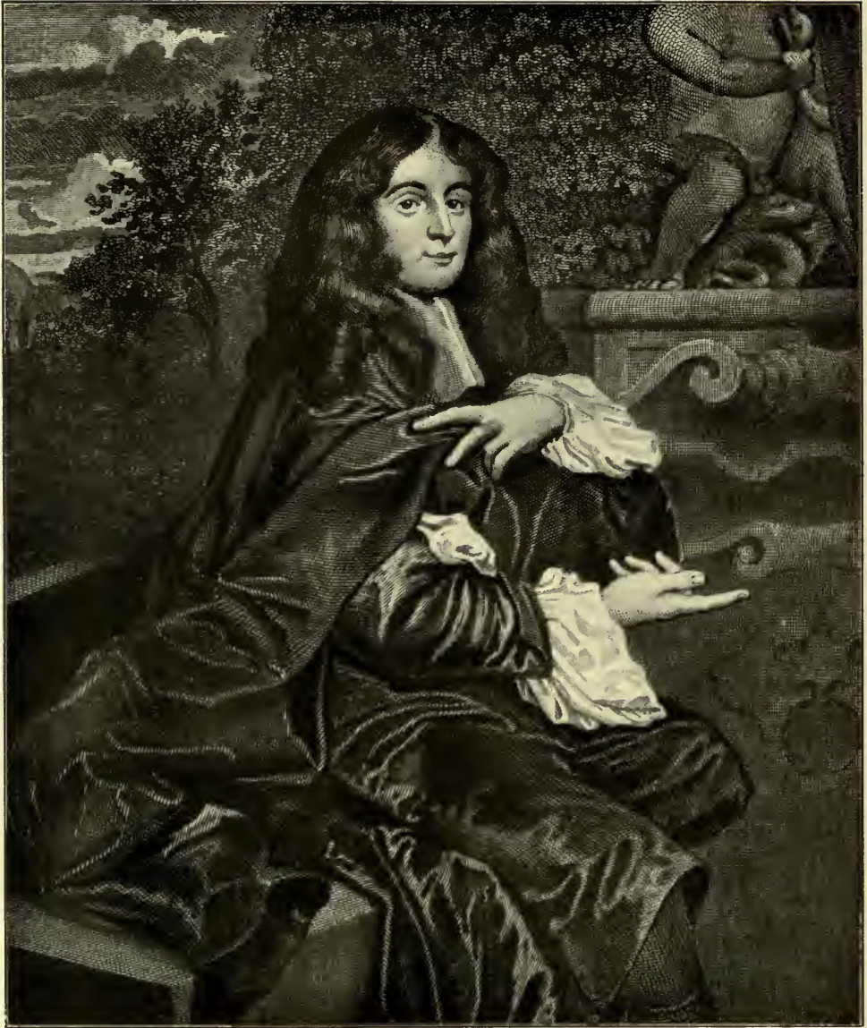
HENRY, SECOND EARL OF CLARENDON.

From the engraving by P. Audinet after Lely.