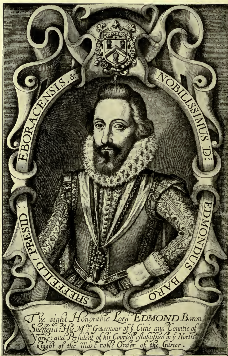
EDMOND, FIRST EARL OF MULGRAVE, K.G.