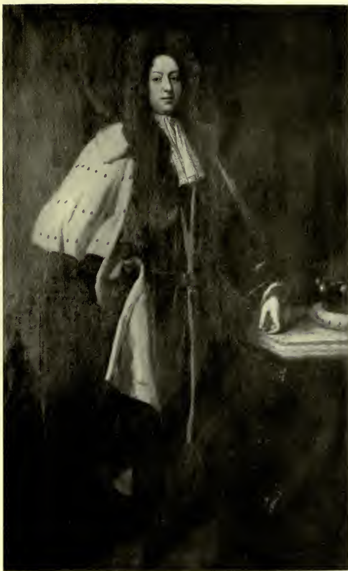
JAMES, FIRST EARL OF ABINGDON. From the original painting in Wytham Abbey. (By permission of the Earl of Abingdon.)