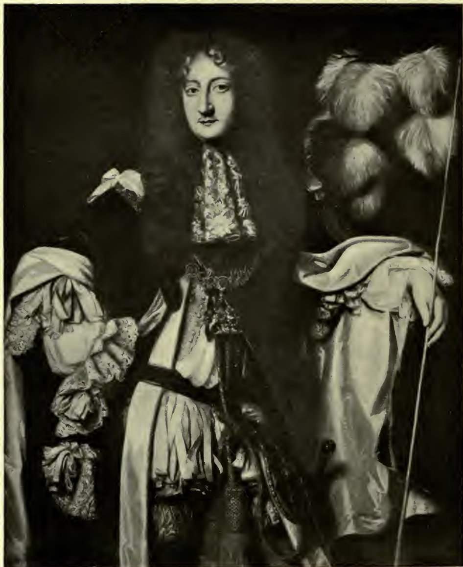
LAWRENCE, FIRST EARL OF ROCHESTER, K.G

From the painting in the National Portrait Gallery.