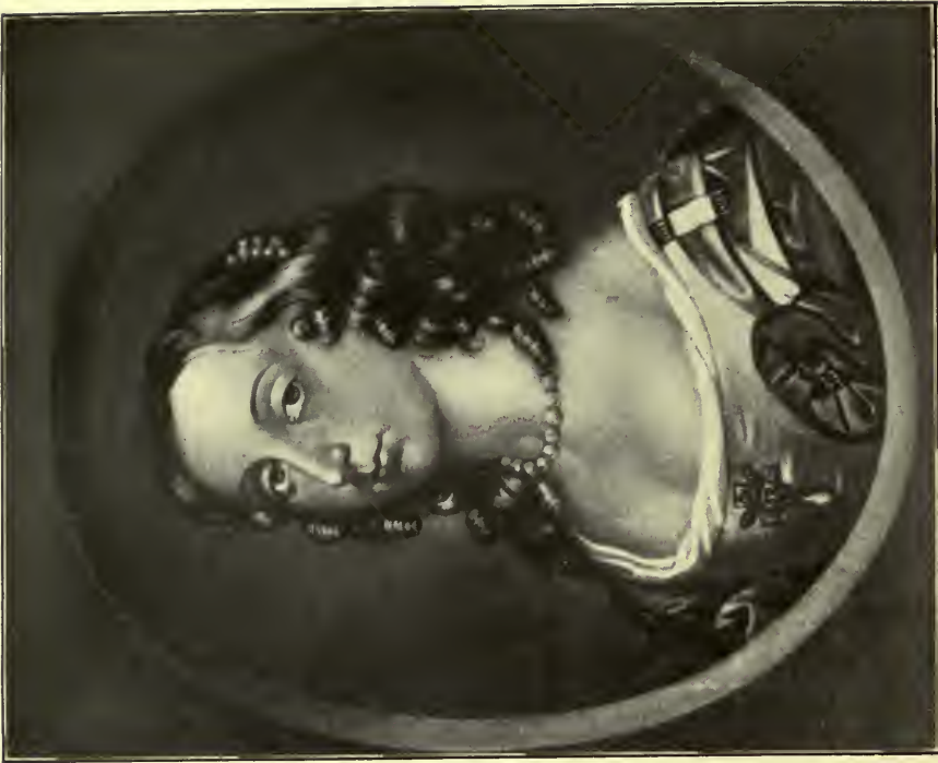
JEMIMA, COUNTESS OF SANDWICH.

From the engraving by J. Thomson after Lely.