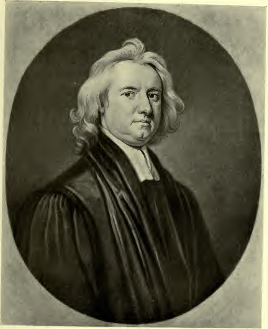
HENRY ALDRICH, DEAN OF CHRIST CHURCH.

From the engraving by J. Smith, after Kneller.