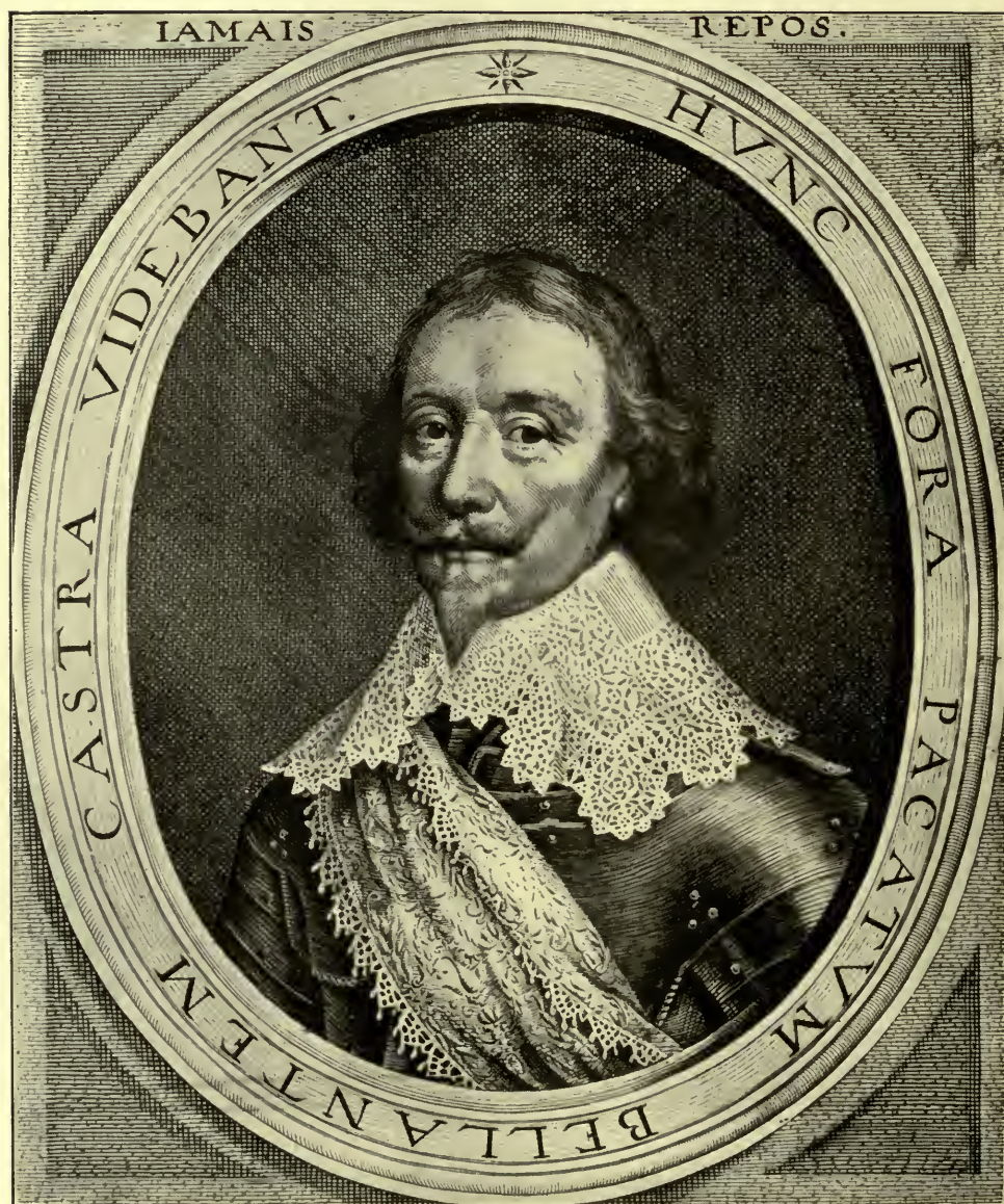
SIR WILLIAM BALFOUR, KNT.