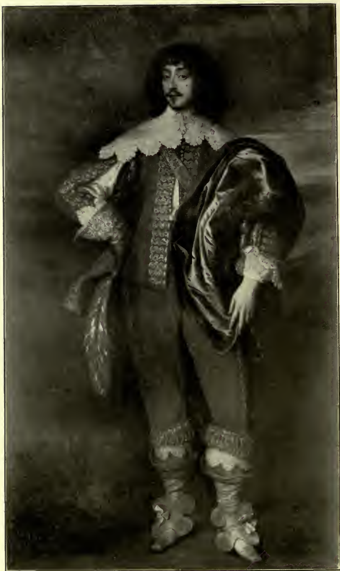
WILLIAM, SECOND VISCOUNT GRANDISON.

From the original painting by Van Dyck at The Grove.