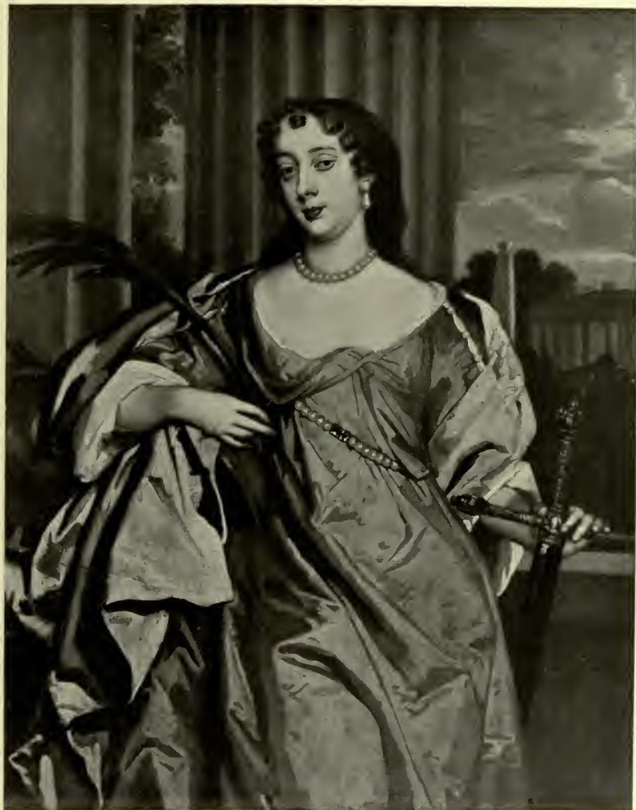
BARBARA, DUCHESS OF CLEVELAND. From the painting in the National Portrait Gallery.