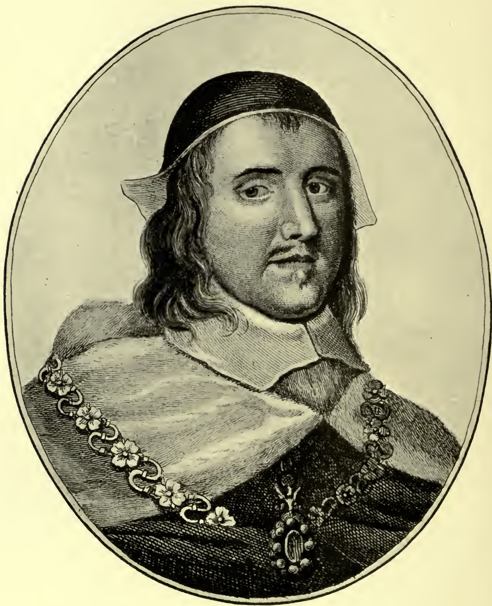
SIR JOHN GLYNNE, KNT.