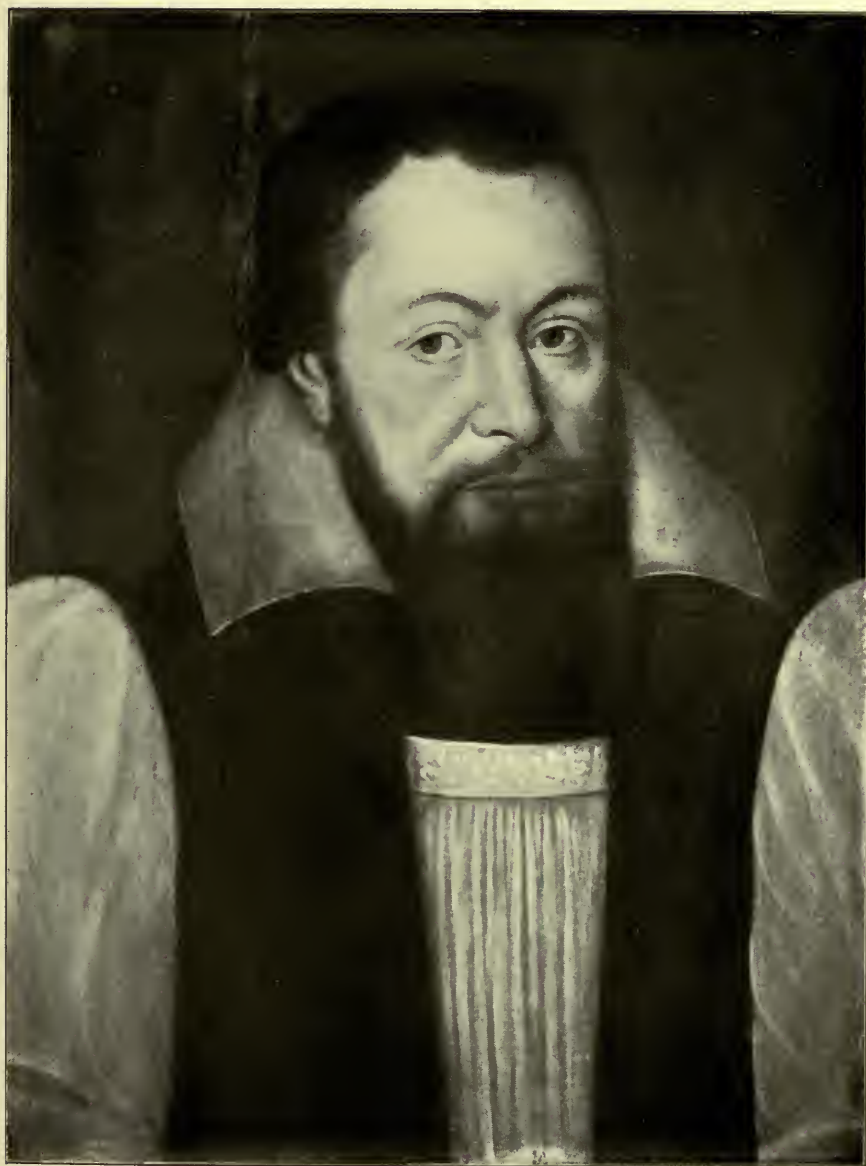
RICHARD NEILE, ARCHBISHOP OF YORK. From the original painting in St. John's College, Cambridge.